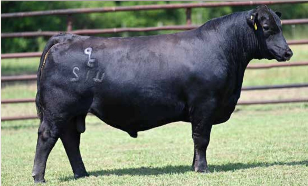
Lot 46 - PF MAN IN BLACK 412