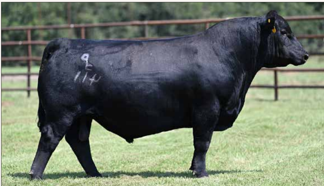
Lot 45 – PF MAN IN BLACK 411