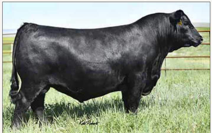
LAR MAN IN BLACK – Sire of Lots 44-48