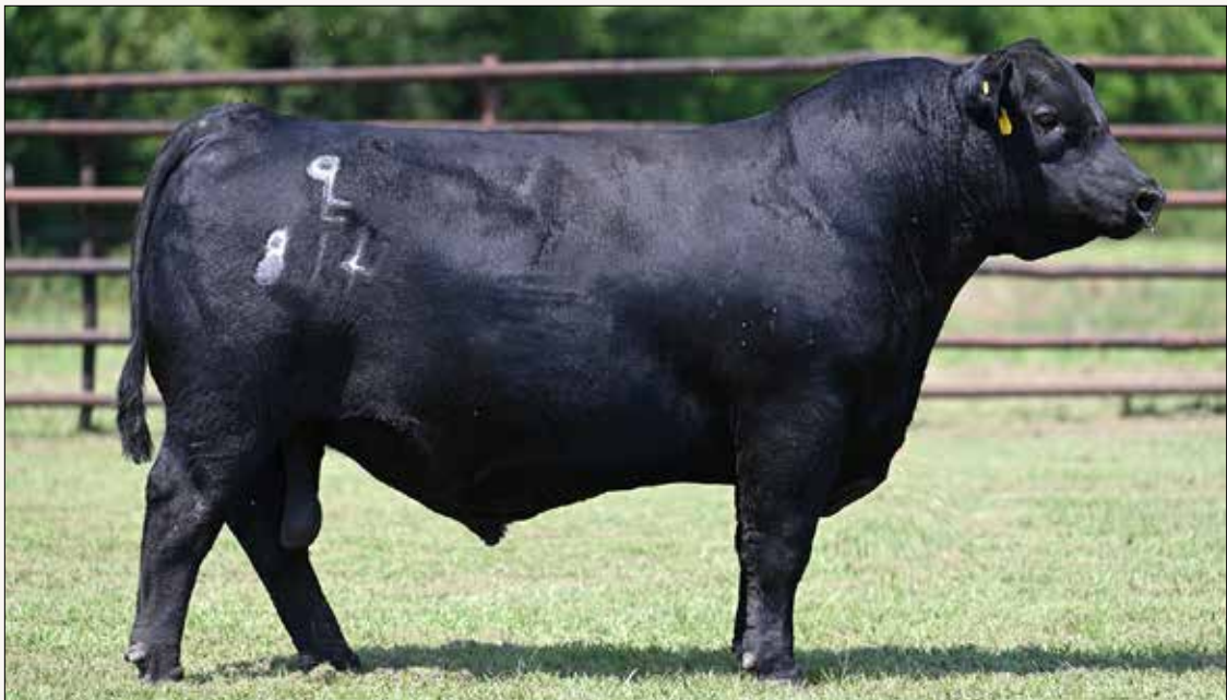
Lot 47 - PF MAN IN BLACK 418