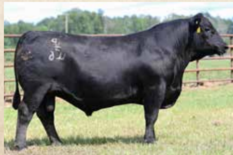
Lot 48 – PF MAN IN BLACK 46