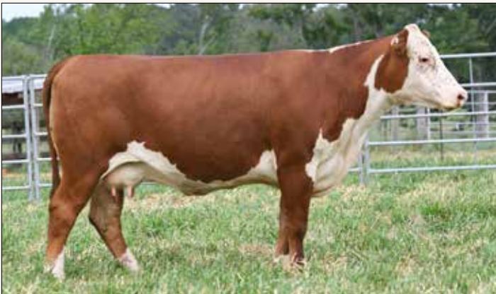
KRM E6 ALLEY D60 G122 – Dam of Lot 13