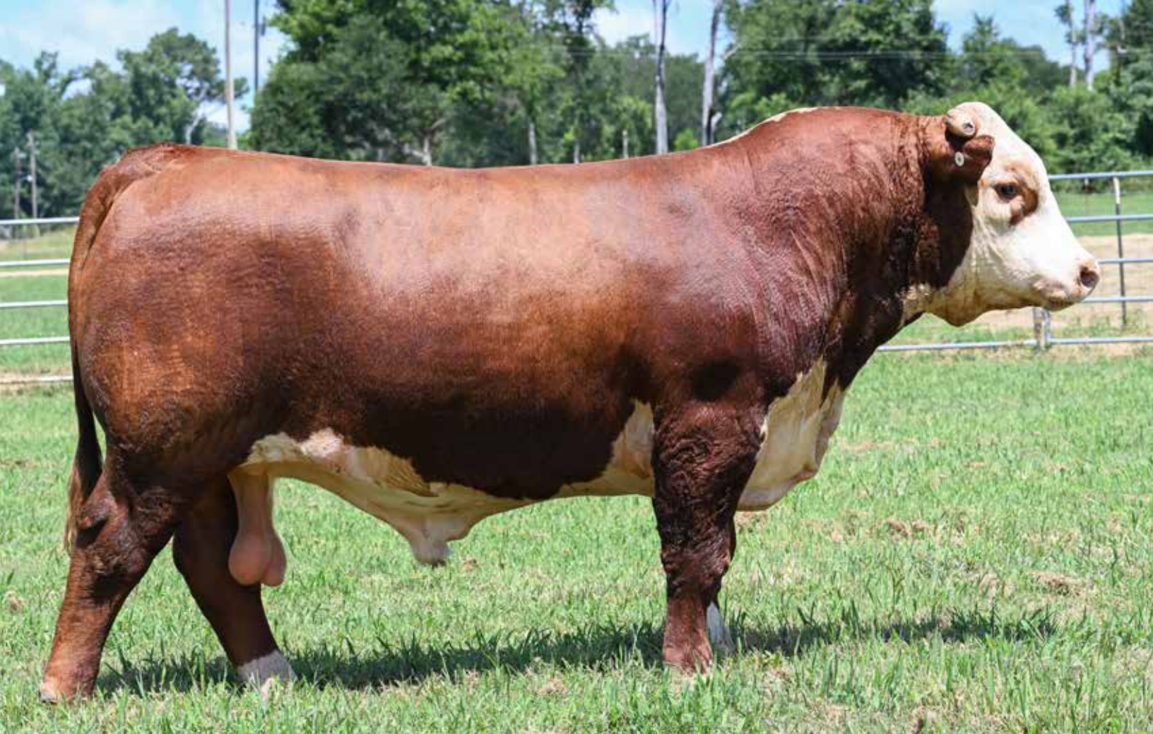
Lot 8 – KRM F1 SIR 8682 L172