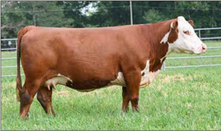
KRM 140 FESTIVE Z210 G11 ET – Dam of Lot 23