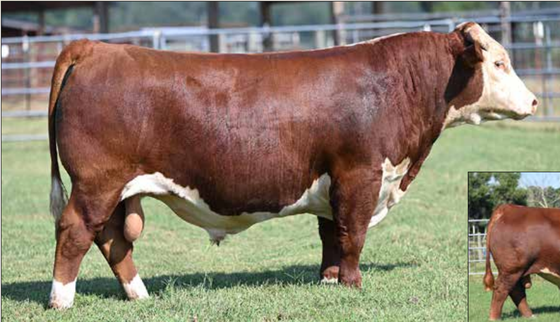
Lot 26 – KRM H150 SIR J120 M38