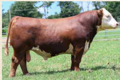
Lot 9 – KRM G74 SIR 8682 L183