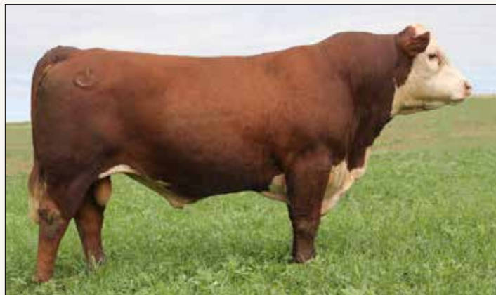
SHF FORESIGHT B413 F158 – Sire of Lots 1 & 2