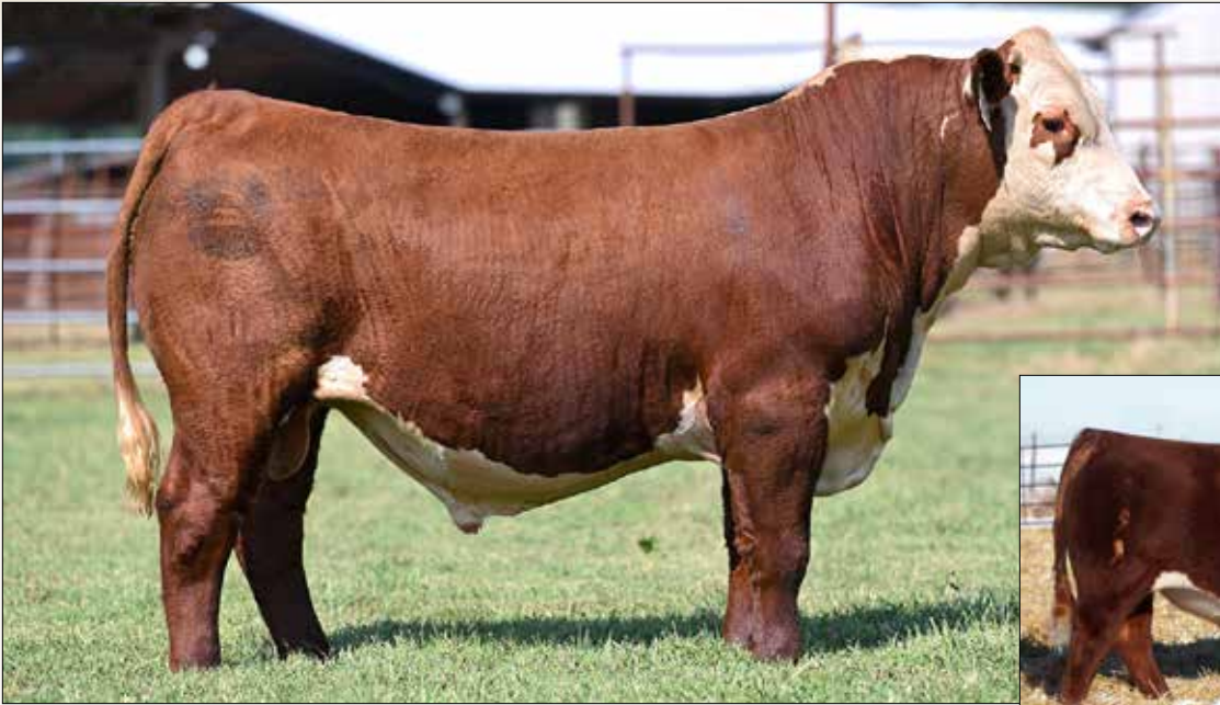
Lot 33 – KRM J131 SIR BALANCE M129