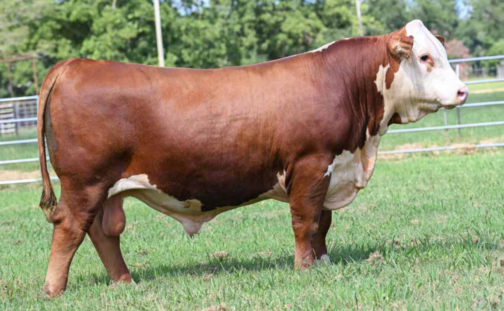
Lot 1 – KRM G138 ALL ME H086 M12 ET