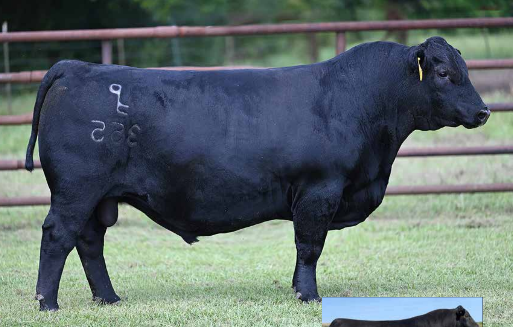
Lot 59 – PF JOSEY WALES 355