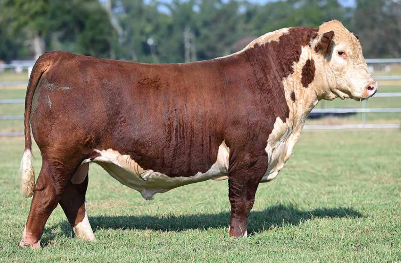
Lot 14 – KRM J160 FORTIFIED M11