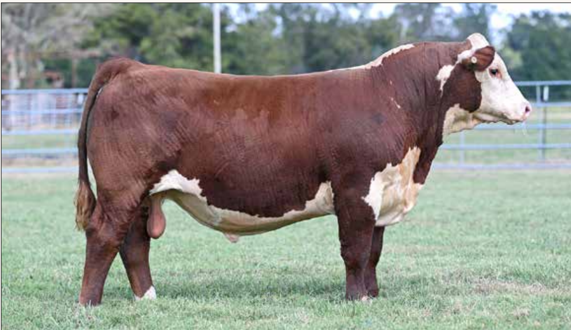
Lot 34 – KRM J100 BALANCE M131