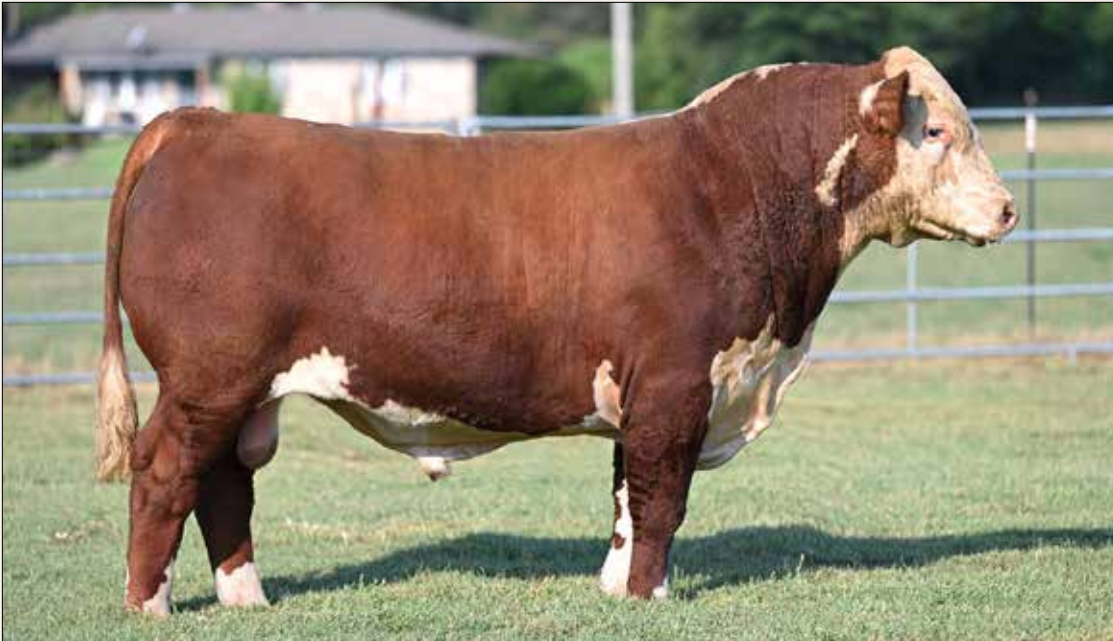
Lot 18 – KRM E101 SIR D731 L179