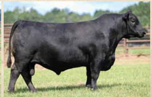
Lot 64 – CSC JOSEY WALES 345L