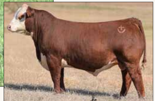
SHF HOUSTON D287 H086 – Sire of Lot 3