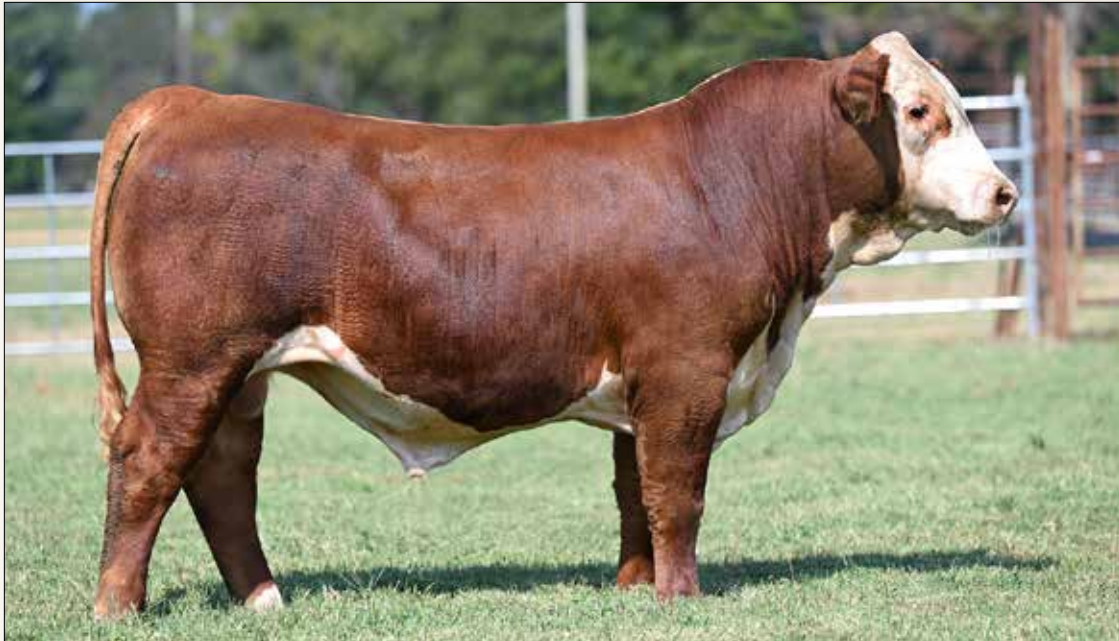
Lot 40 – KRM J113 BANDIT J165 M191