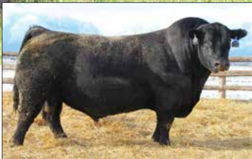
COLEMAN CHARLO 0256 – Maternal grandsire of Lot 51