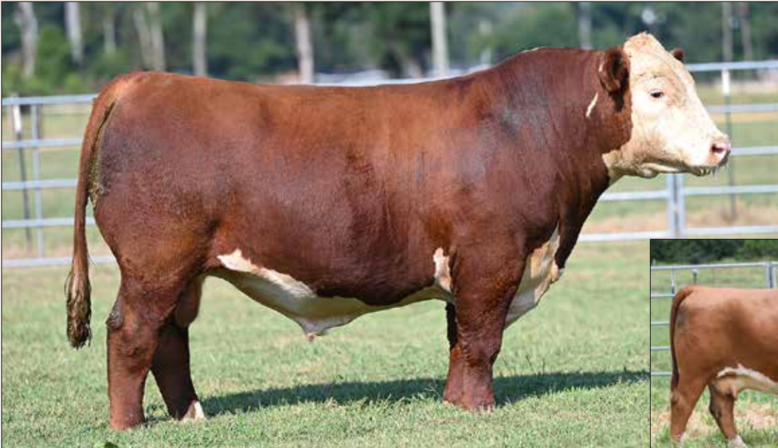
Lot 20 – KRM G57 MOMENTUM L194