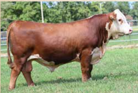
Lot 1 – KRM G138 ALL ME H086 M12 ET

SAT., NOVEMBER 22, 2025 • NOON 12 CST MCGUFFEE HEREFORDS SALE FACILITY • NEW HEBRON, MS