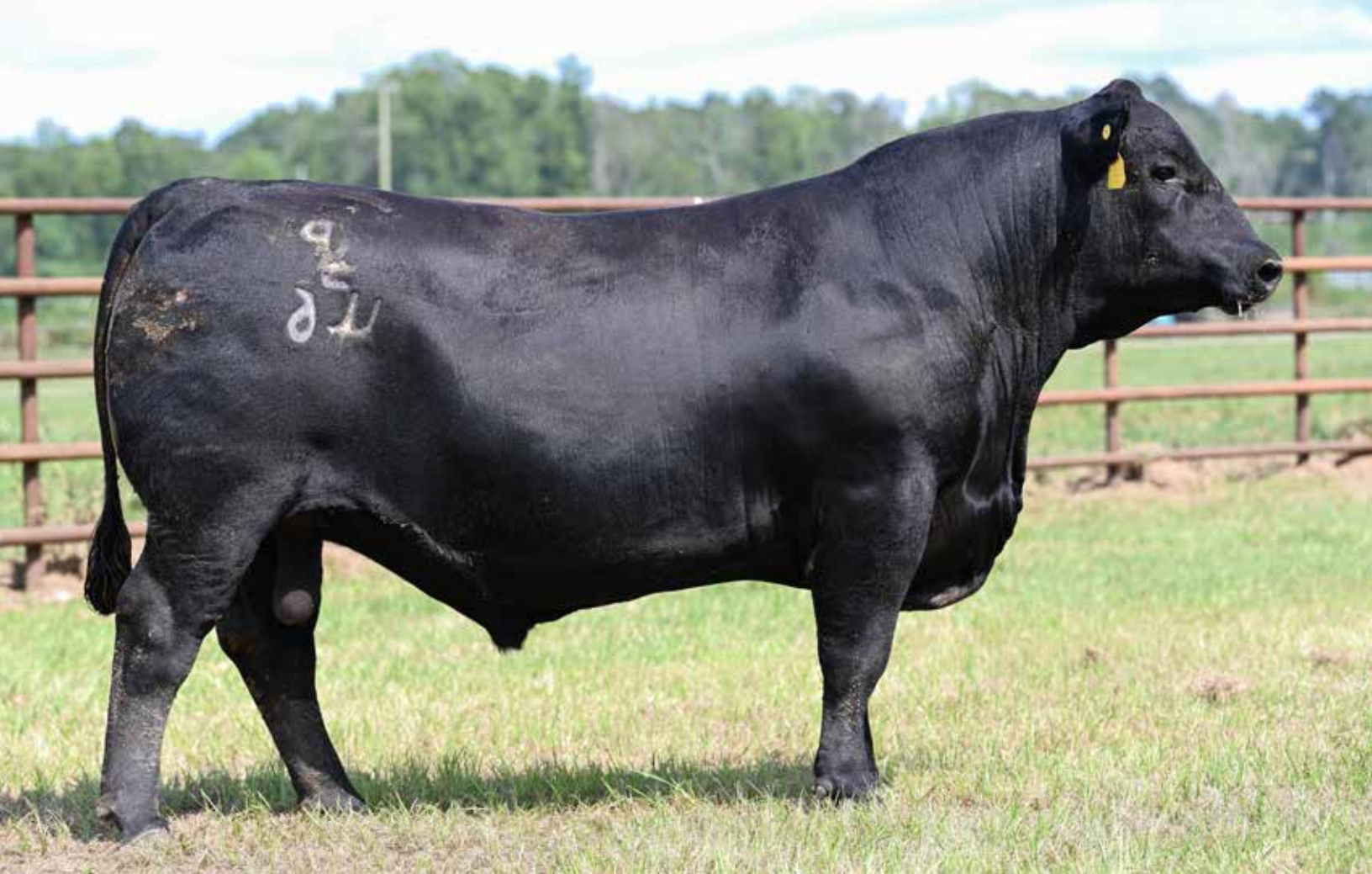
Lot 48 – PF MAN IN BLACK 46