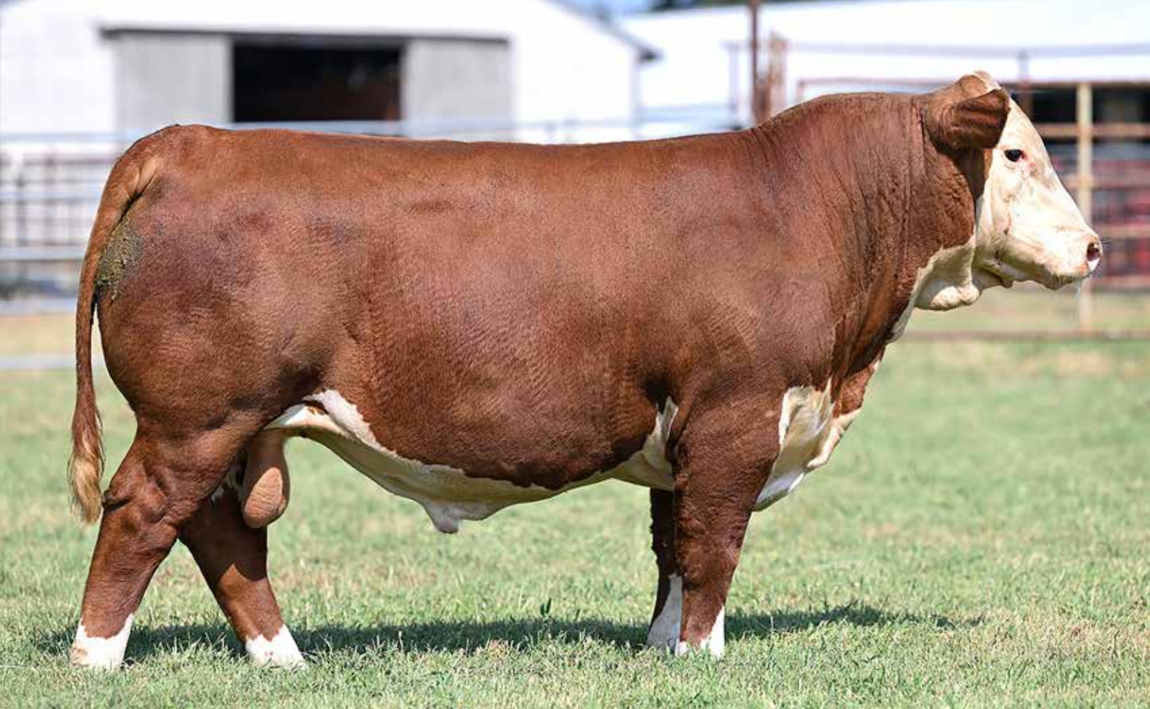
Lot 35 – KRM H17 SIR NATIONWIDE M125