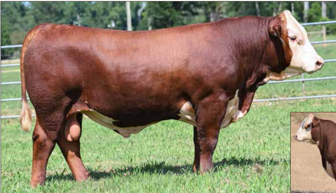
Lot 3 – KRM G138 BIG TX H086 M6 ET