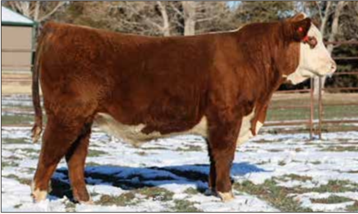
SHF KNUCKLE H324 K252 – Sire of Lots 30 & 37