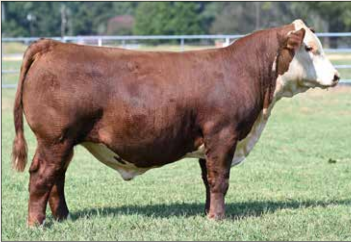
Lot 36 – KRM K81 SIR K098 M171