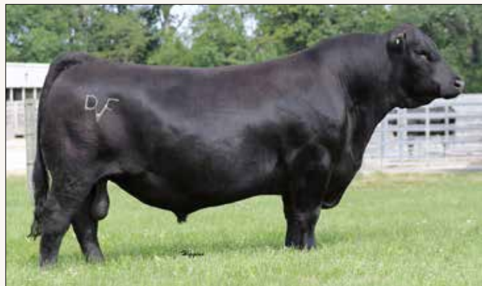
DEER VALLEY GROWTH FUND – Sire of Lot 43