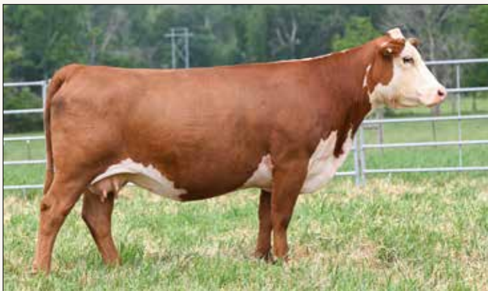
KRM 6002 MISS VISA 49C G138 ET – Dam of Lots 1, 2 & 3