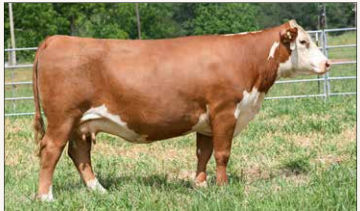
KRM 606 FOREVER UR GIRL F1 ET – Dam of Lot 8