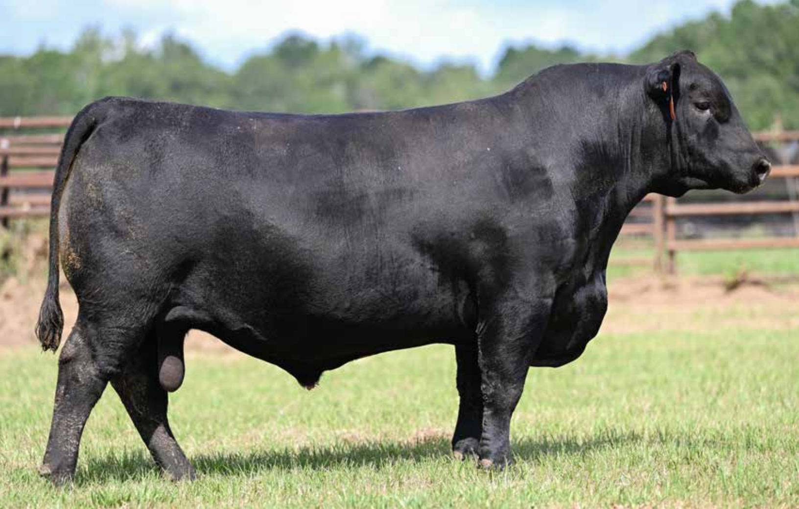
Lot 64 – CSC JOSEY WALES 345L