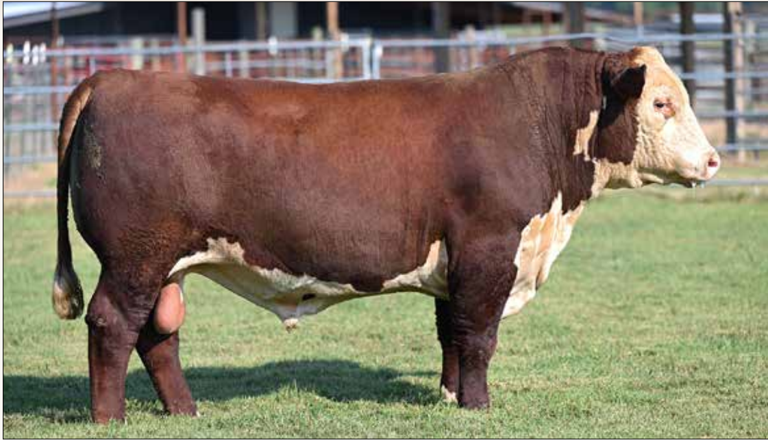
Lot 15 – KRM B7 SIR FORTIFIED L169