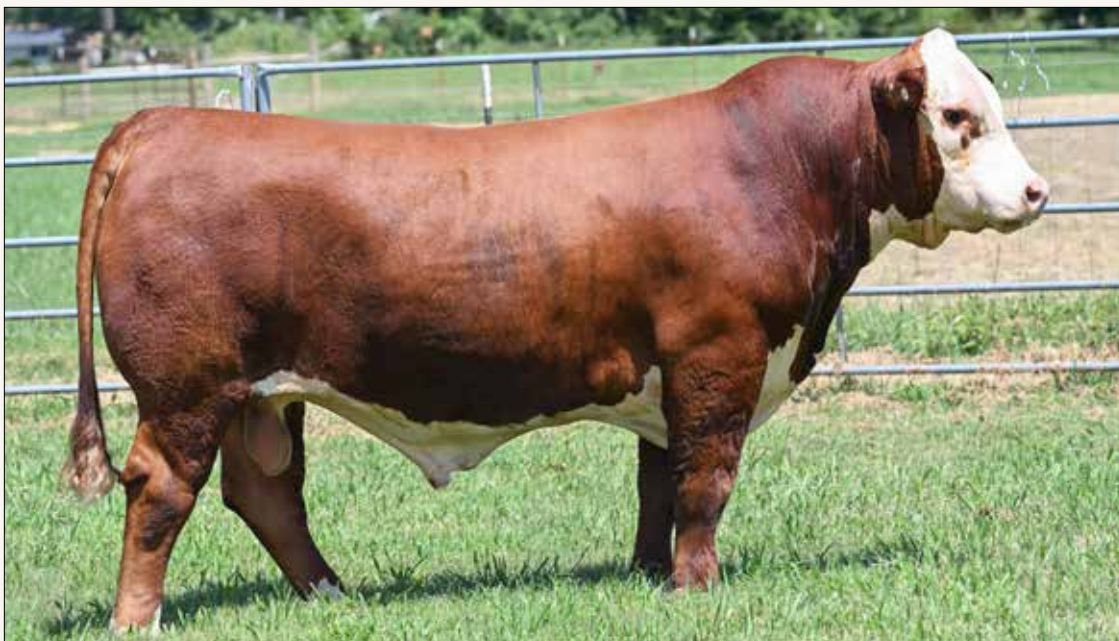
Lot 10 – KRM F54 SIR 8682 L178