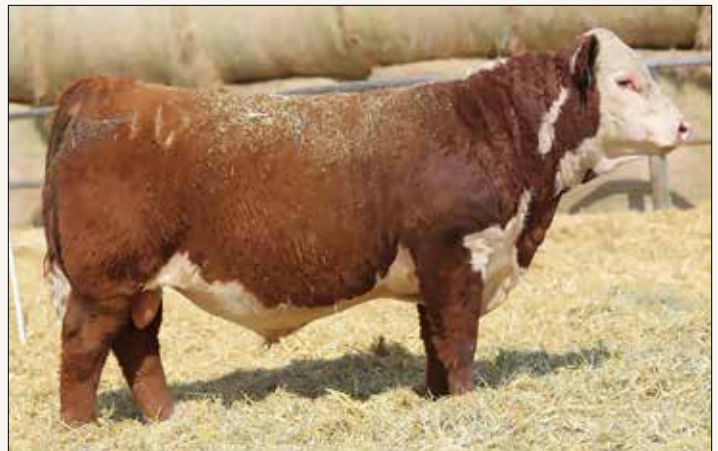
NJVW 84B 4040 FORTIFIED 238F – Sire of Lots 14-16