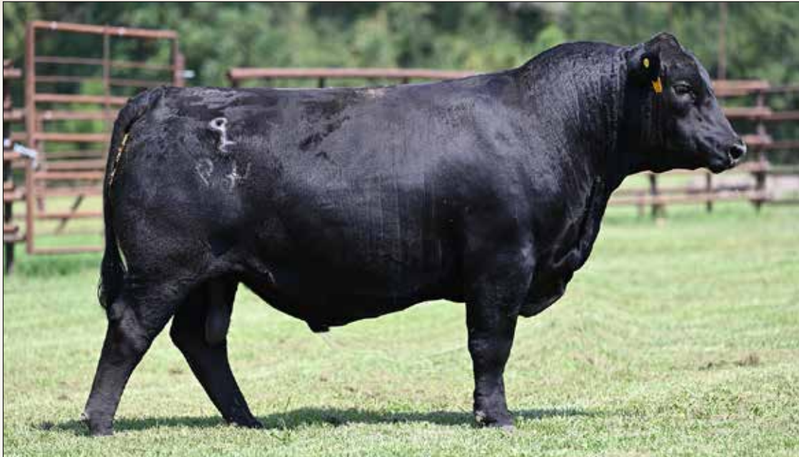
Lot 44 – PF MAN IN BLACK 49