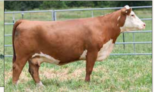
KRM 700E GLORY DAYS 738C G57 – Dam of Lot 20