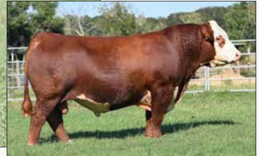
KRM 5036 KABOOM 173D J120 ET – Sire of Lots 26-29