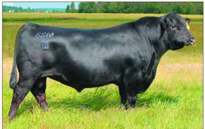
G A R PROPHE – Great Grandsire of Lot 48

CK-Y443 722A CK-KATIE 857Y WCC GRAND HUSTLE 465Y CK BESS PB/273 2411