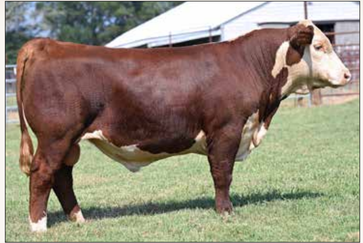
Lot 37 – KRM H10 SIR K252 M146