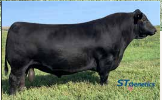
S A V RAINDANCE 6848 – Maternal grandsire of Lot 59 and 60