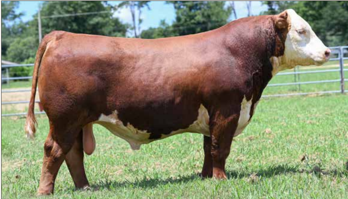
Lot 9 – KRM G74 SIR 8682 L183