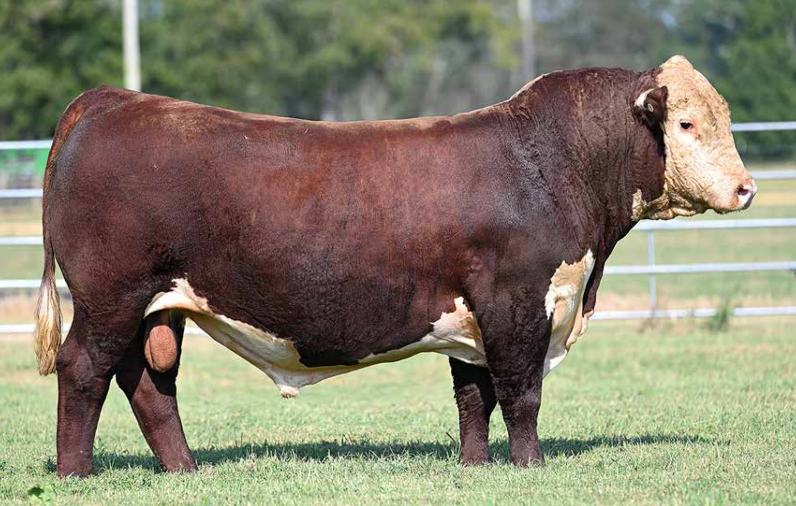
Lot 4 – KRM C58 SIR JET MORE M23