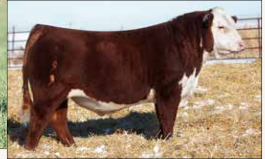
CRR 66589 BALANCE 107 – Sire of Lots 33 & 34