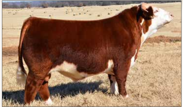
KLD RW MOMENTUM D731 ET – Sire of Lots 18-25