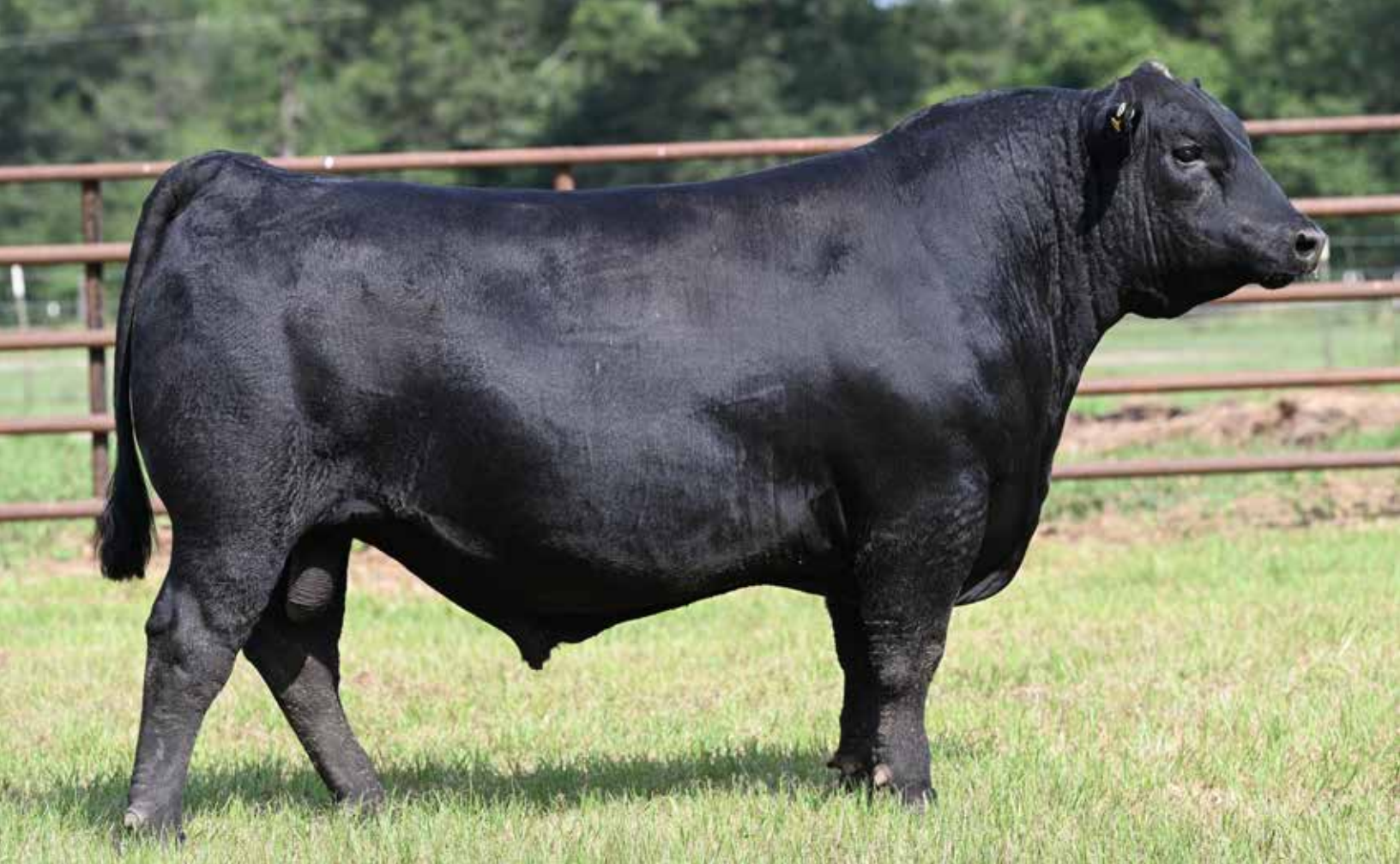
Lot 43 – PF GROWTHFUND 336