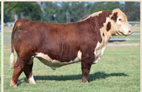
Lot 14 – KRM J160 FORTIFIED M11