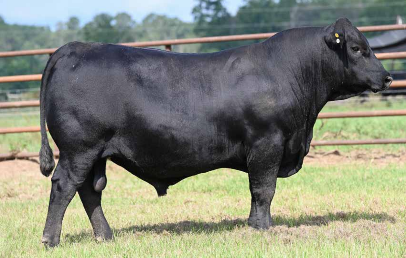
Lot 49 – PF FIREBALL 413