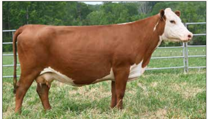
KRM 113 ELLA 4003 D23 ET – Dam of Lot 21