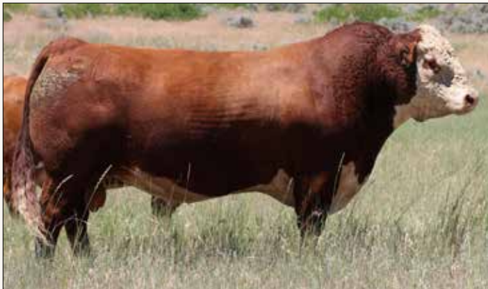
NJW 139C 103C RIDGE 254G – Sire of Lot 17