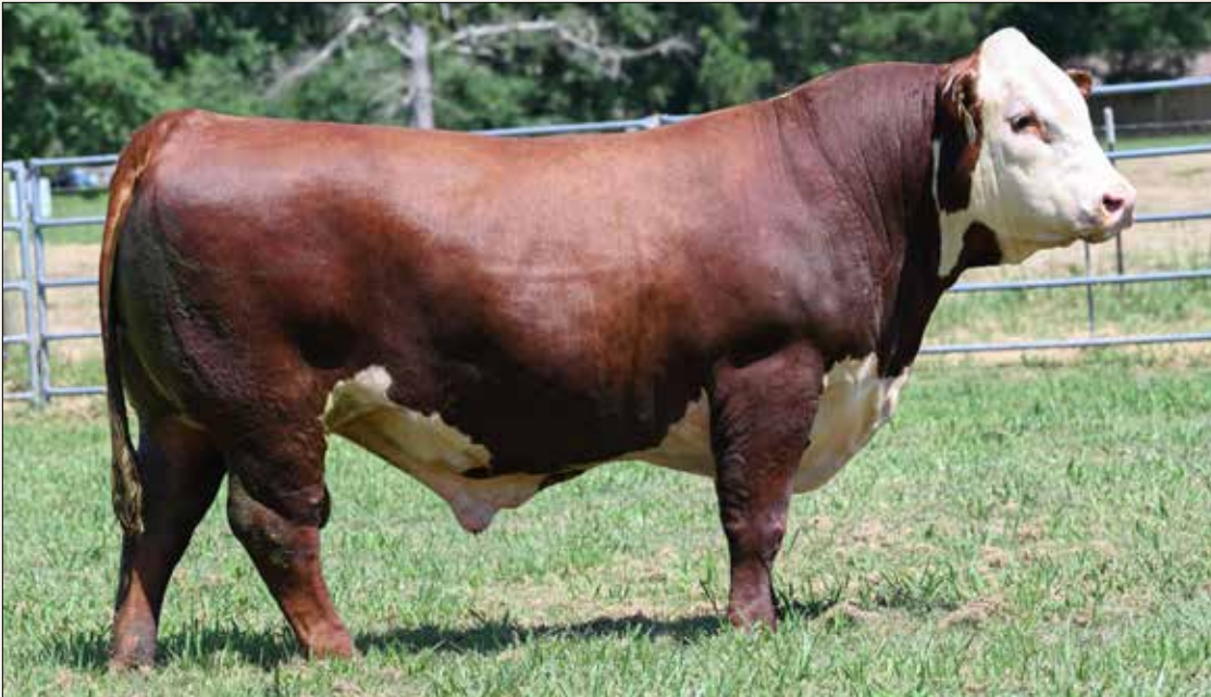
Lot 2 – KRM G138 ONE CALL F158 L199 ET