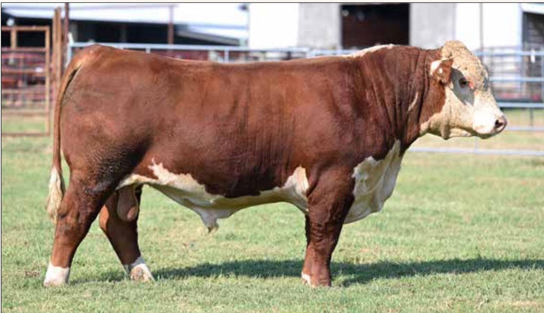
Lot 19 – KRMG9 MOMENTUM L177