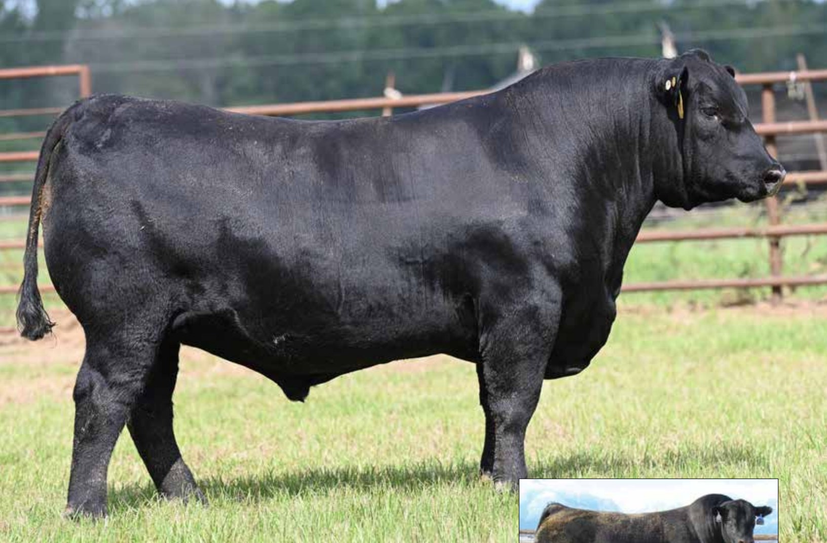
Lot 51 – PF RAWHIDE 338