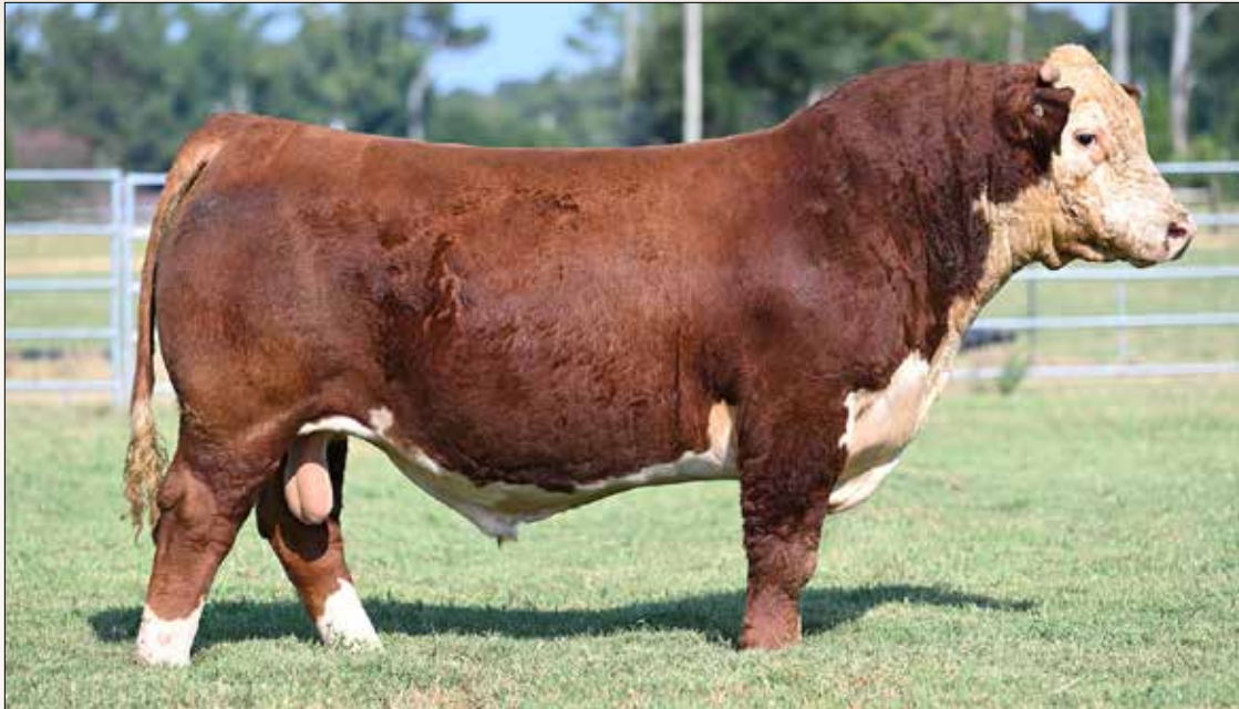
Lot 11 – KRM F24 SUN 8682 L206