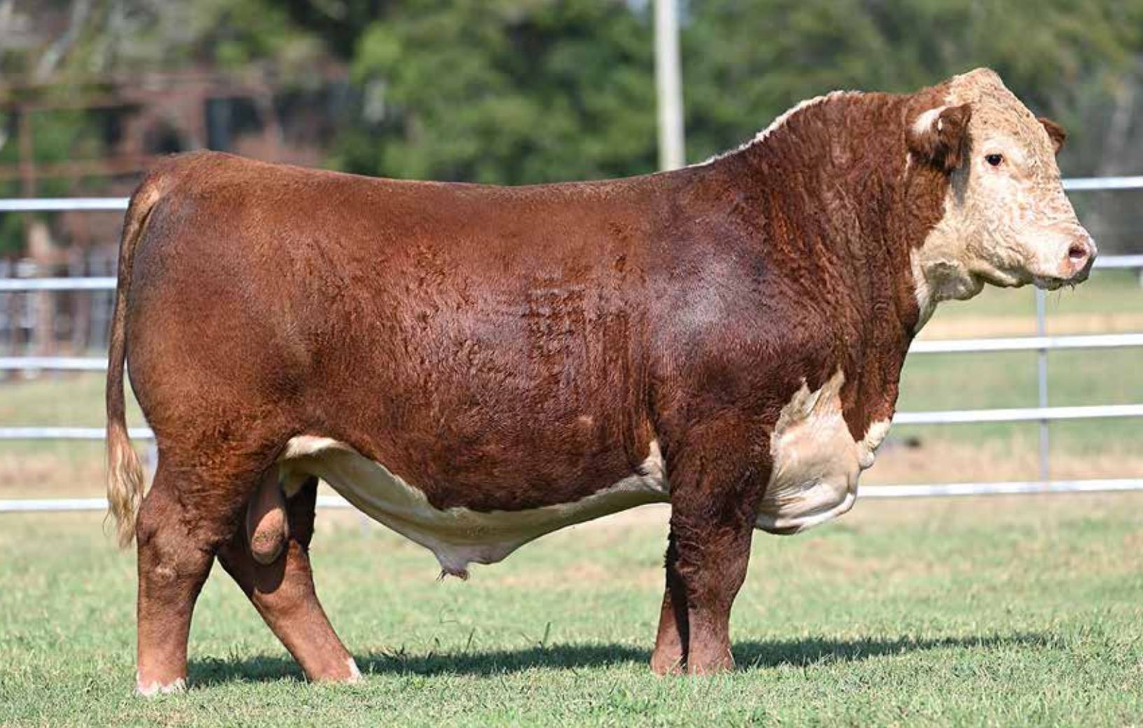
Lot 6 – KRM F145 JETMORE M74