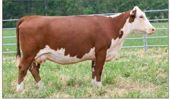
KRM 606 OPEN MIND 6026 H52 ET – Dam of Lot 31