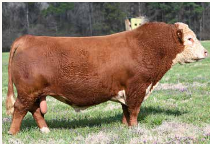
CHURCHILL BR 5JNATIONWIDE 179J – Sire of Lot 35