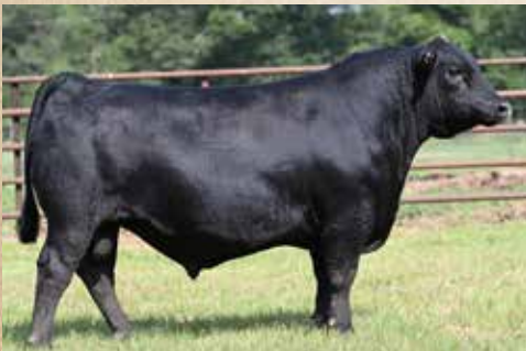
Lot 43 – PF GROWTHFUND 336